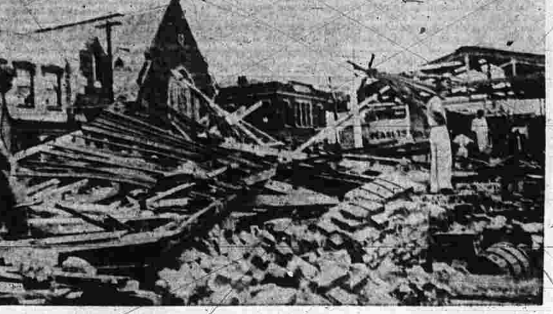
View of the Public Market of Charleston, S. C. shows the historic center shortly after the picture taken. The total death toll shows at least 20 fatal injuries, and 300 persons injured to a lesser extent.